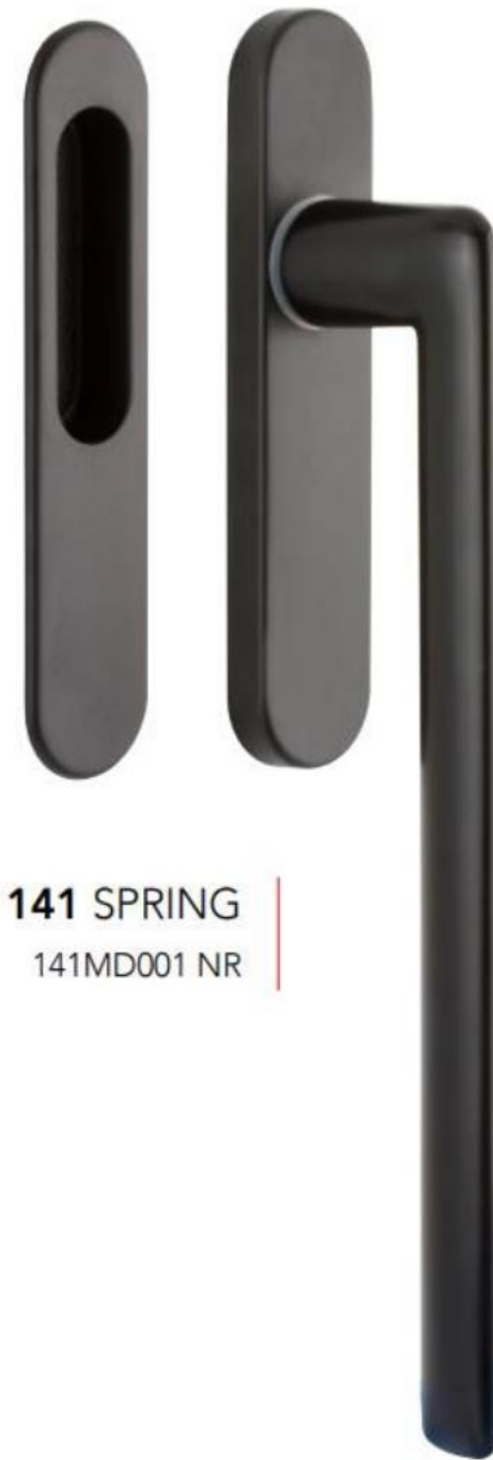
141 SPRING 141MD001 NR