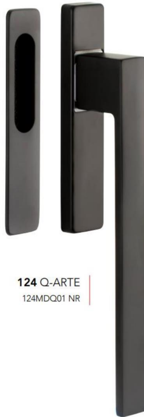
124 Q-ARTE 124MDQ01 NR